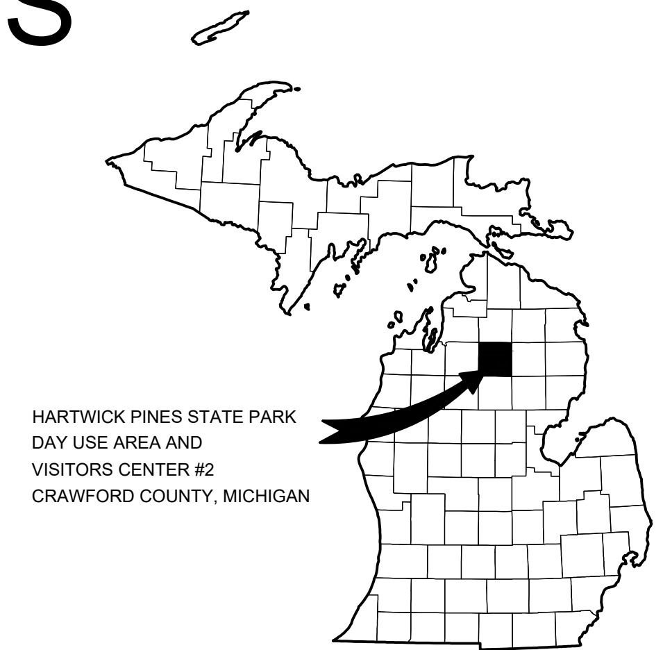
HARTWICK PINES STATE PARK DAY USE AREA AND VISITORS CENTER #2 CRAWFORD COUNTY, MICHIGAN